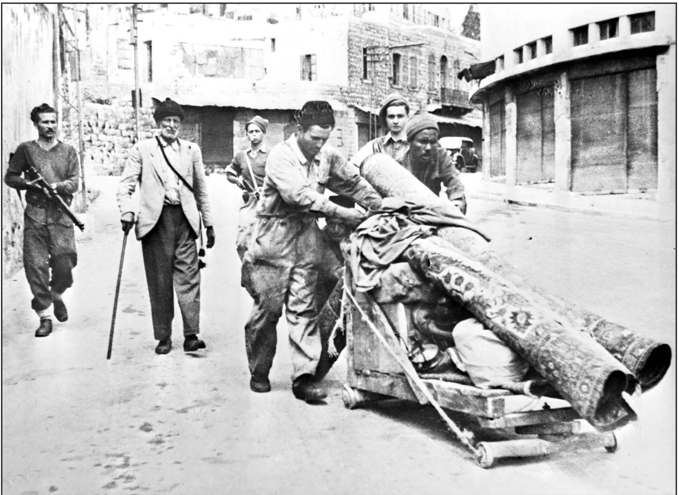
Haganah fighters expel Palestinians from Haifa. May 12, 1948.