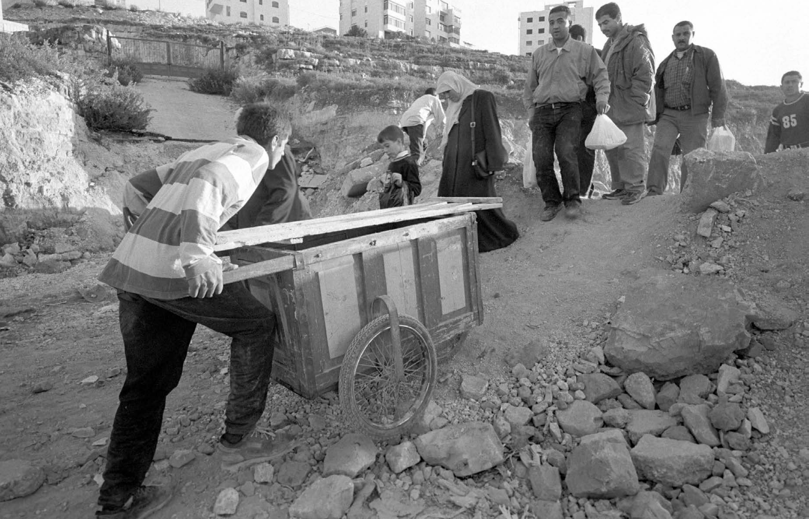
A porter at Surda checkpoint near Birzeit in the West Bank.