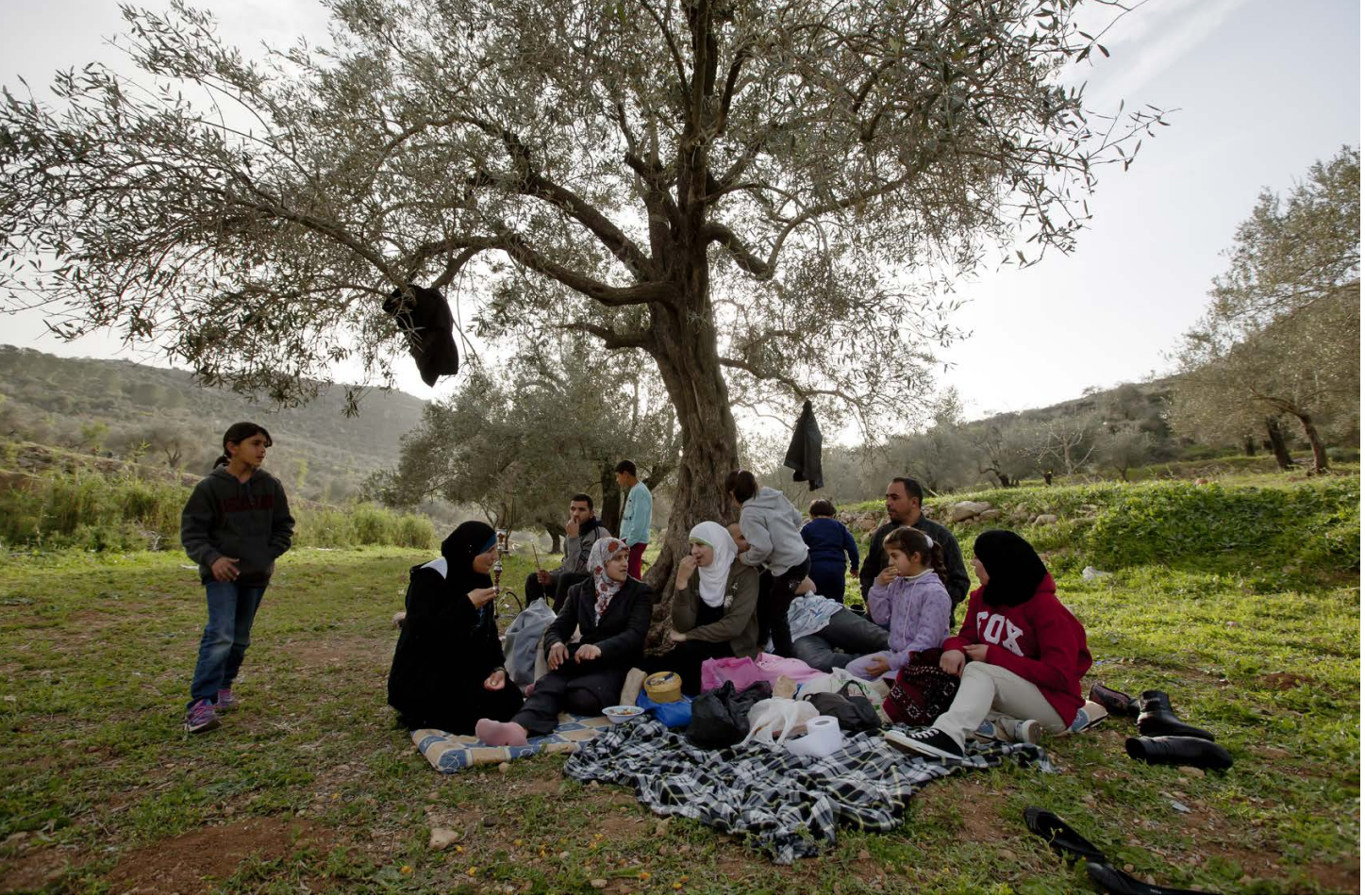
A family picnics near Ramallah. Three Israeli settlements are perched on nearby hilltops.